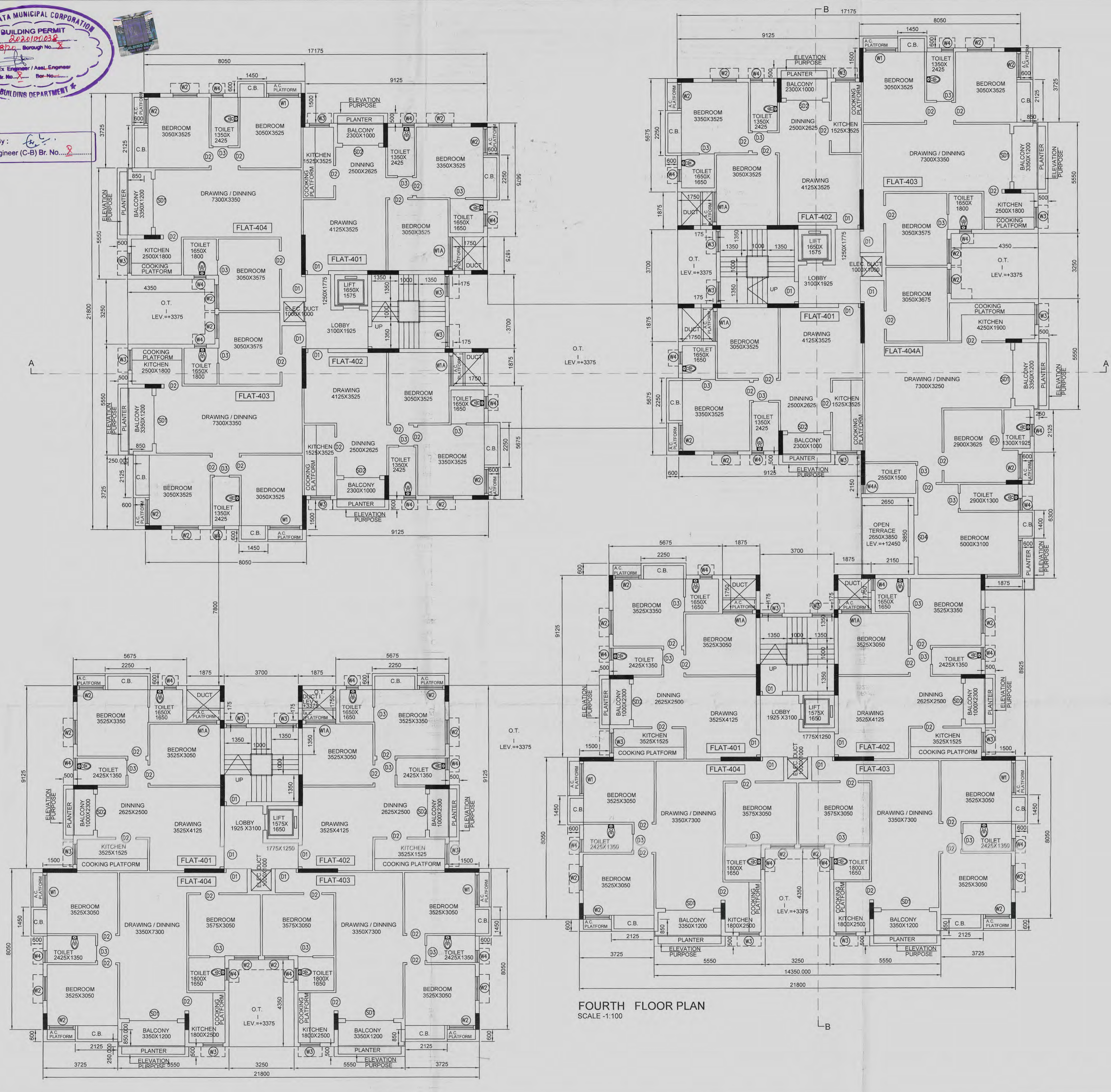
FOURTH FLOOR PLAN SCALE - 1:100

Sanctioned by : Assistant Engineer (C-B) Br. No. 2